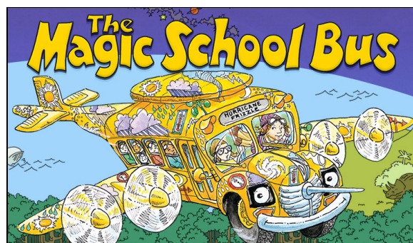
A ZK-Rollup Bus

Imagine Ethereum as a bus. Each bus can only fit so many people (transactions) due to the limitations of having to take care of decentralized consensus, execution, and data availability. So, if only 50 people can board the bus, but 5,000 people want to get on it, the price of tickets will go up (this represents gas fees going up).